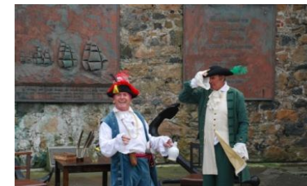
Living History performances