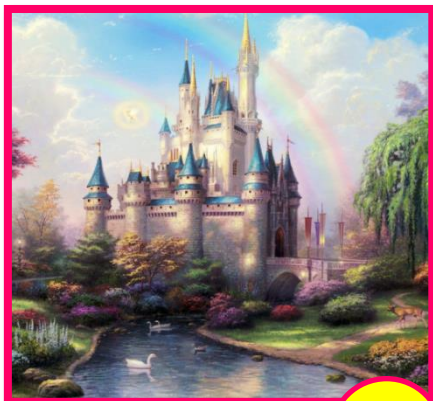
Far Away Fairy Kingdom