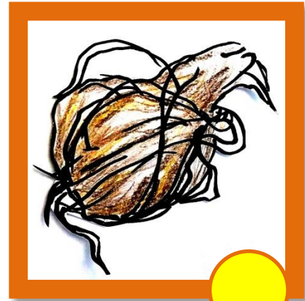
A Plant Bulb