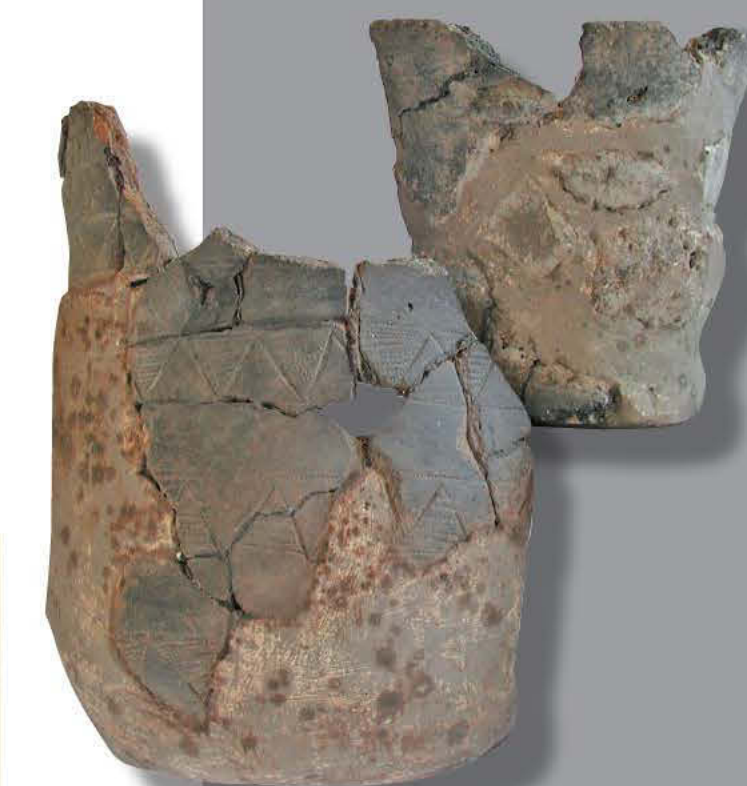
Pottery recovered from the interior of the cist, reconstructed by Lukis