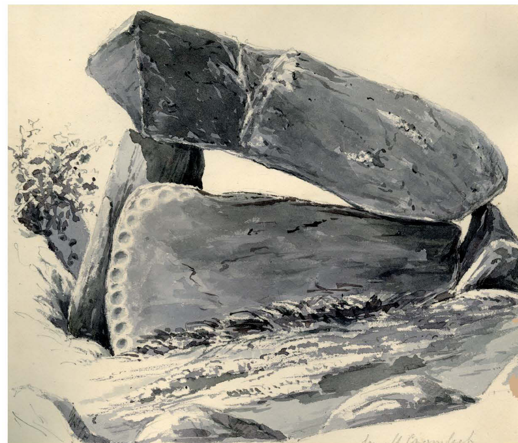
The cist illustrated shortly after excavation watercolour by F.C. Lukis

Excavations by the Lukis family were made between 1837 and 1840, and the finds included Beaker and Late Neolithic pottery, two polished stone axes, and a barbed and tanged flint arrowhead. In 1981, as part of the excavations at Les Fouaillages nearby, the opportunity was taken to re-examine the chamber and its surrounding mound. The chamber had been thoroughly emptied, but most of the mound was undisturbed and pottery of Beaker/Early Bronze Age date was recovered from the earliest levels. The cist dates to c 2500-1800 BC.