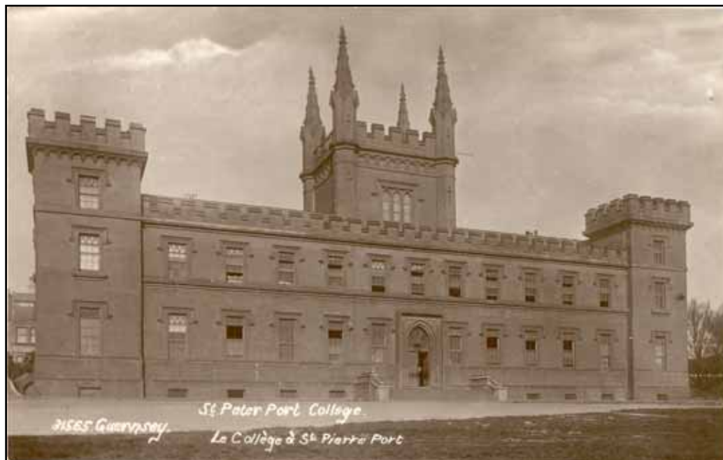
Elizabeth College. Early 20th century.

Terms for board, exclusively, 11 l. 11 s. per quarter.