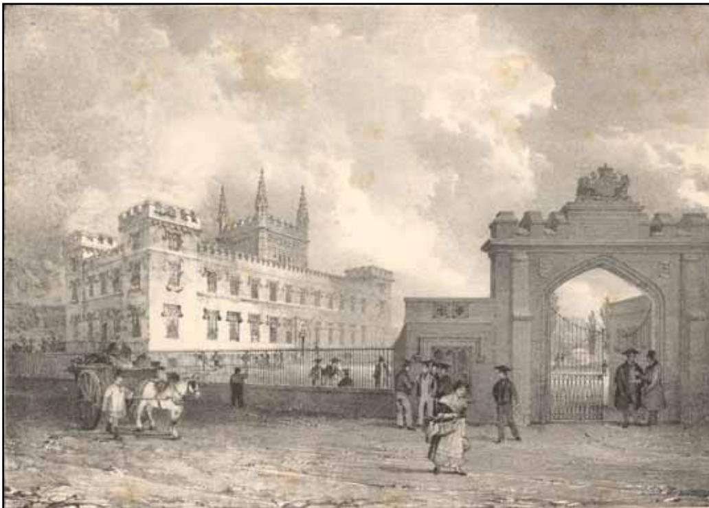
The School of Queen Elizabeth. 1830s.

This new School is the building that still stands to this day.